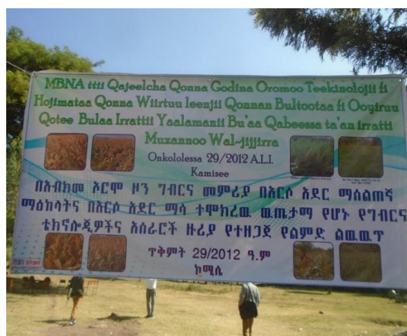
Figure 3. FTCs Experience sharing at Kamisee, Amhara Region