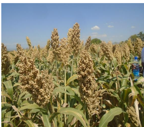
Figure 2. Field performance of varieties

Training centers for technology demonstration. During field day farmers have forwarded their suggestion about the likes and dislikes of each variety (table 9). At the end of the field day session stakeholders have reached agreement to share responsibility in promoting the selected sorghum varieties.