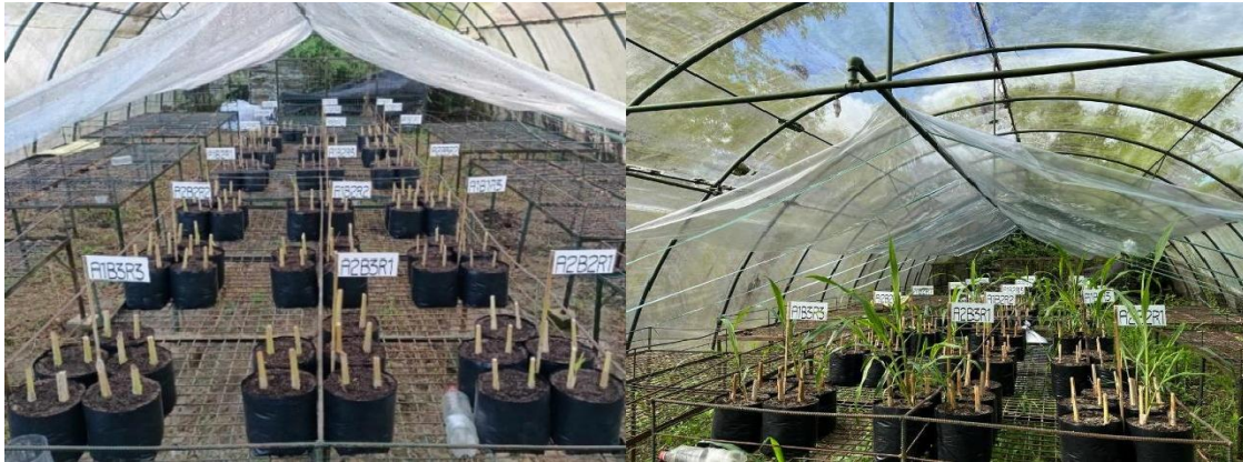
Figure 2. Experimental setup for adlay stem-cuttings under screenhouse conditions.

bags using a draw-by-lot procedure, with three replications per treatment combination. The treatments were assigned as follows: Factor A (Adlay genotypes): A1 = Gulian, A2 = Kiboa; Factor B (Portions of stem cuttings): B1 = Upper portion, B2 = Middle portion, B3 = Base portion.